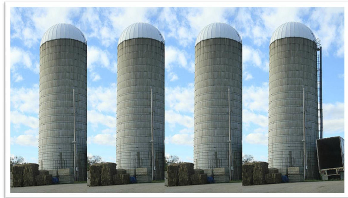
Doc Searls via Wyllo