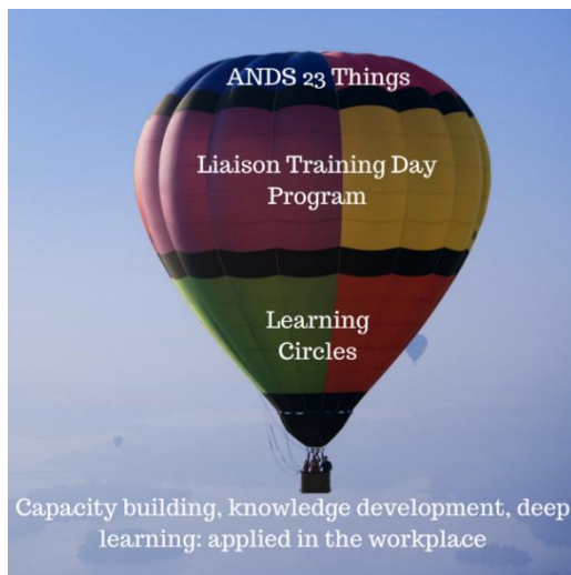
Image 3: Pictorial representation of the 2016 liaison librarian training program

Now in 2016, as the liaison librarians have grown in confidence they have embraced the problem based style of instruction that has been incorporated into the training program. Each of the training sessions are designed to progressively scaffold skill and knowledge acquisition and address topics such as developing a personal philosophy of learning and teaching; understanding discipline specific pedagogical approaches; designing learning experiences for the online environment and performing action research. Each of the training sessions seeks active participation of liaison librarians. This includes showcasing of innovative programs by faculty liaison librarians and their use of learning platforms such as Smart Sparrow in either