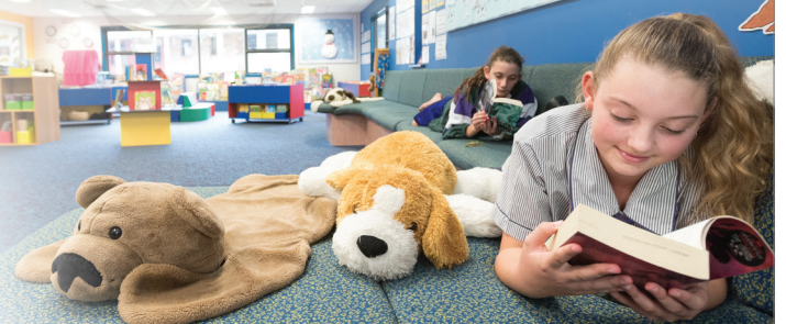
Calvary Christian College (Carbrook Campus)