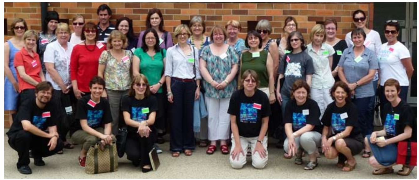
ABOVE Participants and tutors (in the front wearing Institute t-shirts) who attended the inaugural residential Australian Evidence Based Practice (EBP) Librarians' Institute.