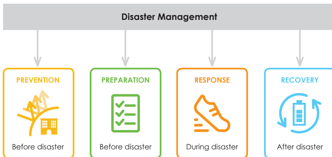
Figure 1: Disaster management - key stages

The four key stages in disaster management are Prevention, Preparation, Response and Recovery. They are represented sequentially in the diagram below.