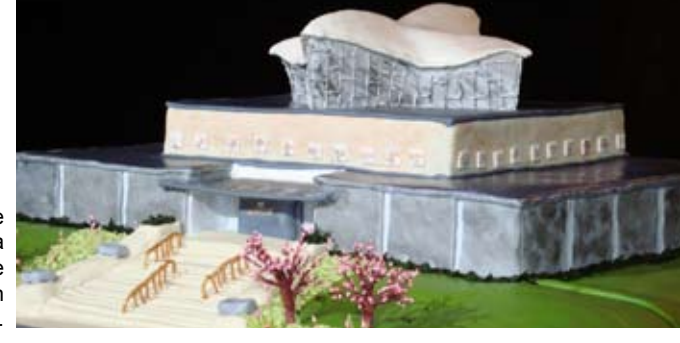
LEFT – That unique birthday cake – a sweet rendition of the NLM building in Bethesda, MD.

There you can download abstracts to papers along with other information.